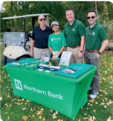
Northern Bank with some awesome giveaways!